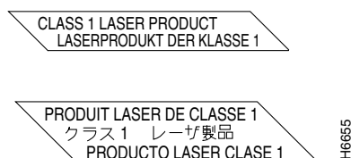
Figure 2-1 Laser Warning Labels for Single-Mode Port

The single-mode transmitter in the module uses a small laser to transmit the light signal to the network ring. Keep the transmit port covered whenever a cable is not connected to it. Although multimode transceivers typically use LEDs for transmission, it is good practice to keep open ports covered and avoid staring into open ports or apertures. The single-mode aperture port contains a laser warning label, as shown in Figure 2-1 .