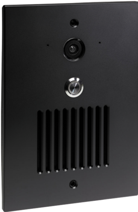
Figure 2. Cisco Smart+Connected Video Door Station External

The Cisco Smart+Connected Video Door Station External provides easy-to-use, secure communications between a visitor outside the dwelling or at a gated entryway and the homeowner inside a residence using a Cisco Smart+Connected Touchscreen. It delivers full-motion video intercom and the fidelity of wideband audio intercom for crystal-clear communications and video security throughout the home. The External Video Door Station comes in satin black and is designed to withstand harsh weather conditions. Features include: