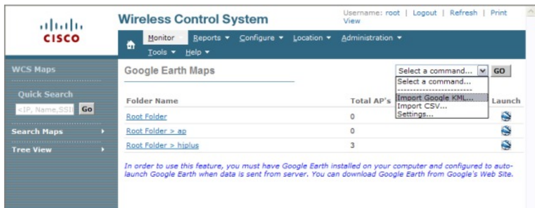
Figure 2: Importing New Folder into Google Earth

Step 5 Import the new Google KML folder. It displays in the folder name summary.