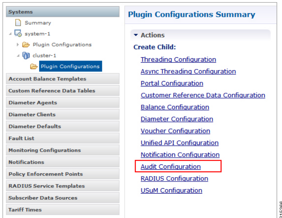
Figure 1: Plugin Configurations Summary

Step 2 Click Audit Configuration in the right pane to open the Audit Configuration dialog box.