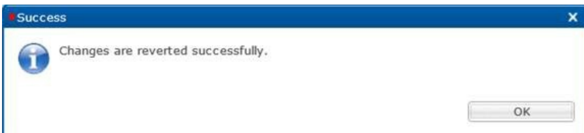
Figure 3: Success Confirmation Message