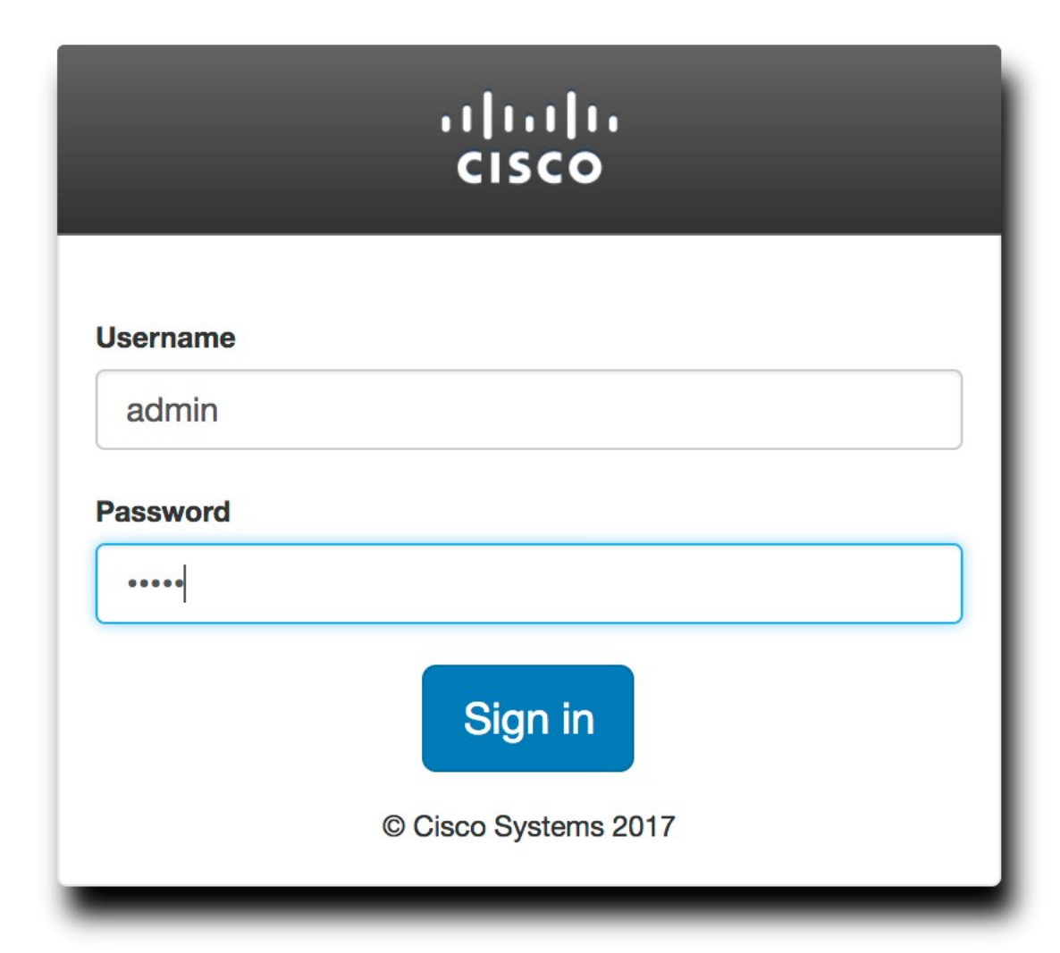
Figure 1: CPS DRA Login

Step 4 In the Management screen, click the Login link to display the in-browser terminal window.