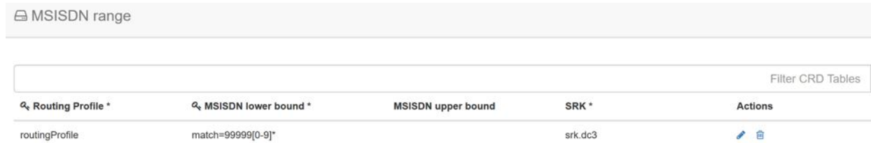
Figure 29: MSISDN Range