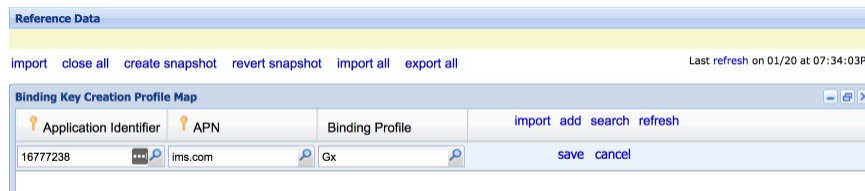
Figure 30: Binding Key Profile Creation Map

The available fields are Boolean fields and can be edited by selecting the check boxes.