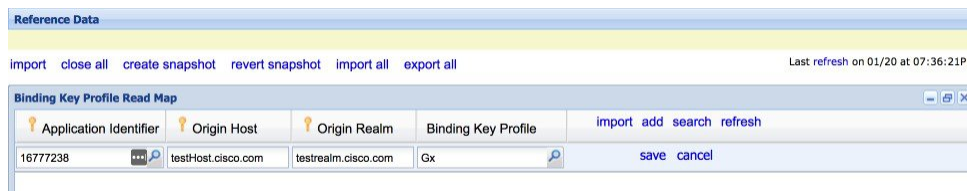
Figure 31: Binding Key Profile Read Map

The available fields are Boolean fields and can be edited by selecting the check boxes.