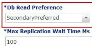
Figure 6: Db Read Preference

An example Cluster configuration is given: