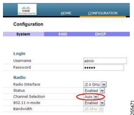
Figure 14: Channel Selection for OEAP 600 Series APs

The 600 series scans and chooses channels for 2.4-GHz and 5-GHz during startup as long as the default settings on the local GUI are left as default in both spectrums.