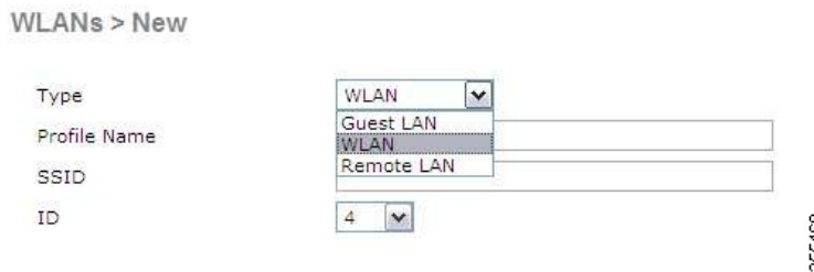
Figure 11: Remote LAN Settings for OEAP 600 Series AP

Remote LAN is configured in the same way that a WLAN or Guest LAN is configured on the controller: