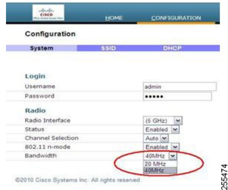
Figure 15: Channel Width for OEAP 600 APs

The channel bandwidth for 5.0 GHz is also configured on the 600 Series OfficeExtend Access Point Local GUI, for 20-MHz or 40-MHz wide channels. Setting the channel width to 40 MHz for 2.4 GHz is not supported and fixed at 20 MHz.