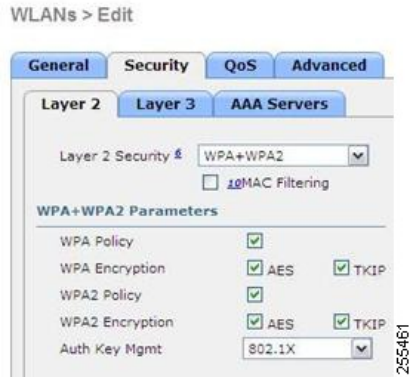
Figure 8: Compatible Security Settings for OEAP Series