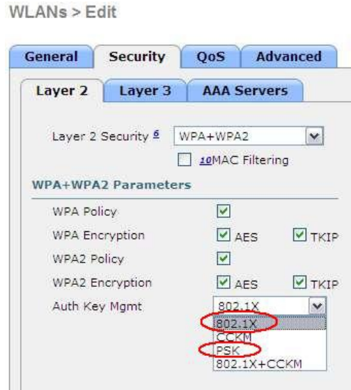
Figure 4: WLAN Security Settings - Auth Key Management

In the Security tab (see the following figure), do not select CCKM in WPA+WPA2 settings. Select only 802.1X or PSK.