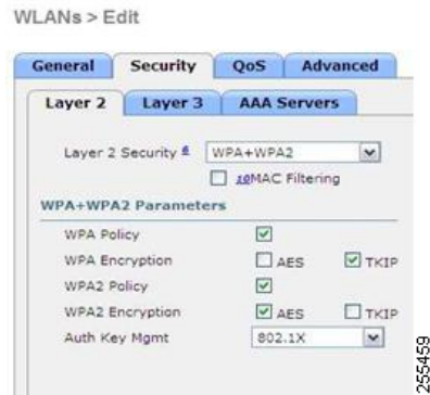
Figure 6: Incompatible WPA and WPA2 Security Encryption Settings for OEAP 600 Series