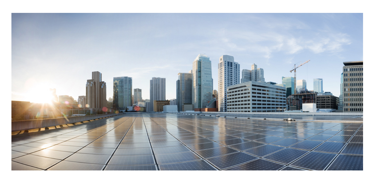
Thresholding Configuration Guide, StarOS Release 21.26