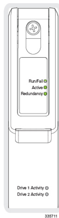
Figure 4: FSC Status LEDs

The possible states for all FSC LEDs are described in the sections that follow.