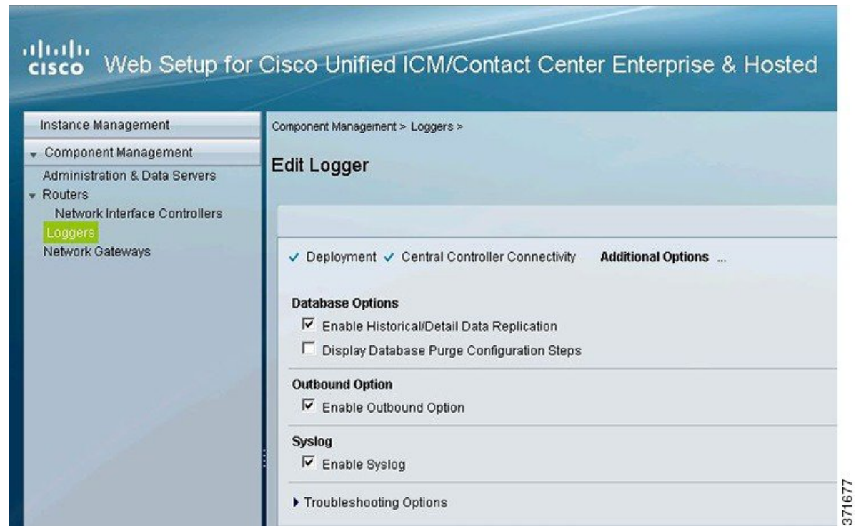
Figure 1: Enable Syslog

These steps runs the CW2KFEED process when the logger is started.