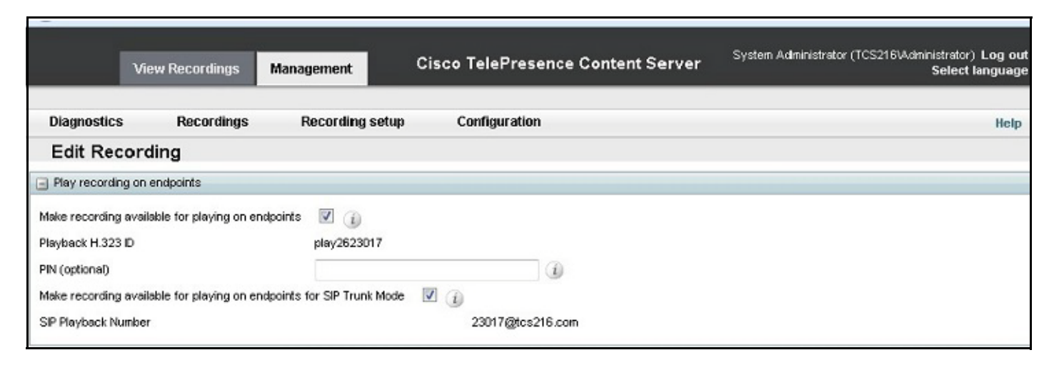
Figure 1-1 Play recording on endpoints