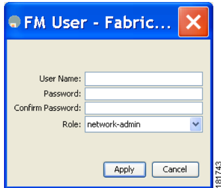
Figure 3-2 FM User Dialog Box

Step 3 Set the user name and password for the new user, and then click Apply .