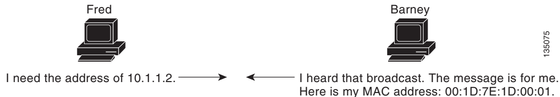
Figure 2-1 ARP Process

When the destination switch lies on a remote network which is beyond another switch, the process is the same except that the switch that sends the data sends an ARP request for the MAC address of the default gateway. After the address is resolved and the default gateway receives the packet, the default gateway broadcasts the destination IP address over the networks connected to it. The switch on the destination switch network uses ARP to obtain the MAC address of the destination switch and delivers the packet. ARP is enabled by default.