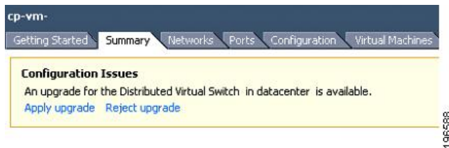
Figure 3: vSphere Client DVS Summary Tab

Step 2 Click the vSphere Client DVS Summary tab to check for the availability of a software upgrade.