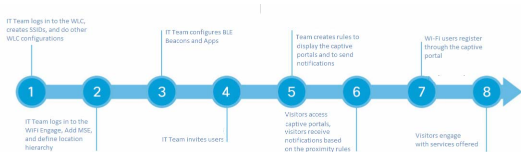
Figure 1-2 Process Flow for the WiFi Engage

The process flow for the WiFi Engage is as shown in Figure 1-2 .