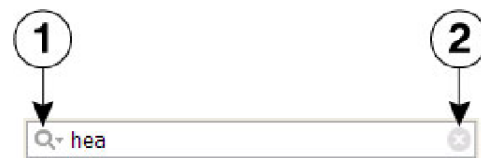
Figure 12-2 List Filter Field

A List Filter field is provided above the results in the Show Contents dialog box. You can use the List Filter field to quickly locate any entries that contain a specified text string.