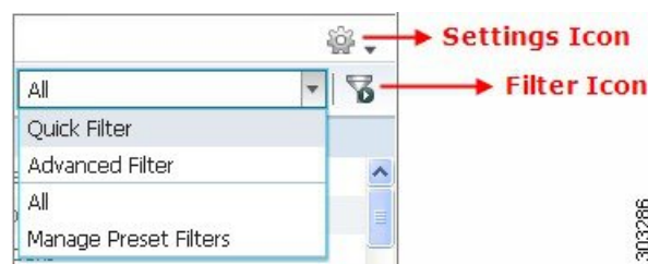
Figure 3: Data Filters Example

You can customize and filter the information that displays in the listing pages using the settings and filter icons.