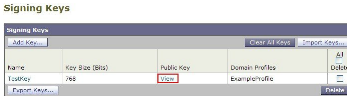
Figure 2: View Public Key Link on Signing Keys Page