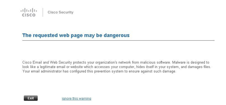
Figure 1: Cisco Security Splash Screen Warning (proxy_splash_screen)

The only way to access the Cisco web security proxy is through a rewritten URL in a message. You cannot access the proxy by typing a URL in your web browser.