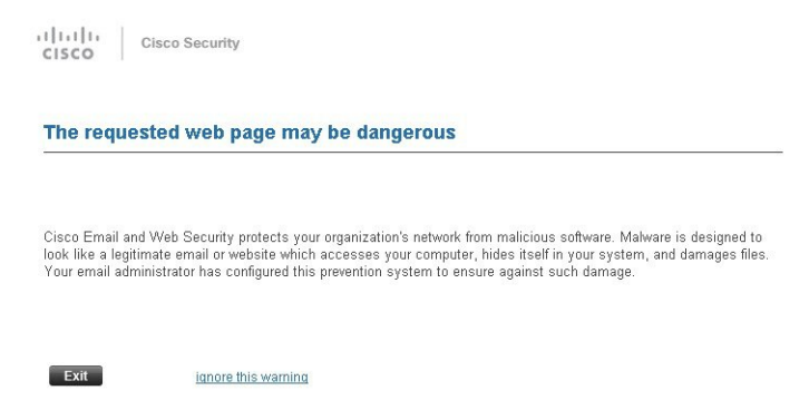
Figure 1: Cisco Security Splash Screen Warning (proxy_splash_screen)

The only way to access the Cisco web security proxy is through a rewritten URL in a message. You cannot access the proxy by typing a URL in your web browser.