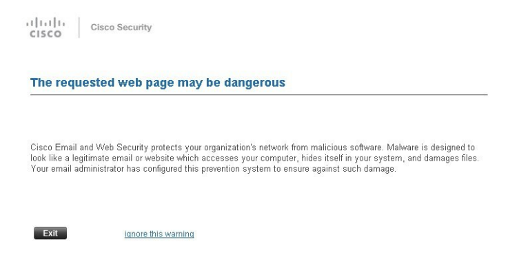
Figure 1: Cisco Security Splash Screen Warning (proxy_splash_screen)

The only way to access the Cisco web security proxy is through a rewritten URL in a message. You cannot access the proxy by typing a URL in your web browser.