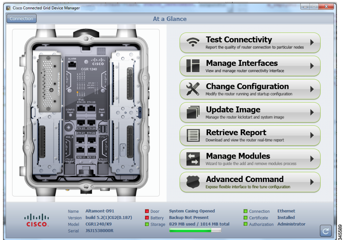
Figure 1-2 At a Glance Page for the CGR 1240

In addition to supported tasks (right-side), the At a Glance page provides a view of the CGR 1000 router to which the Device Manager is connected (left-side).