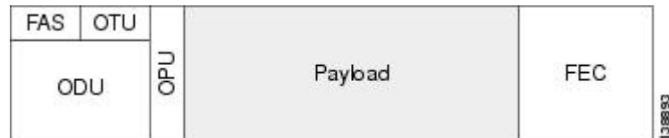
Figure 2: OTN Optical Channel Structure