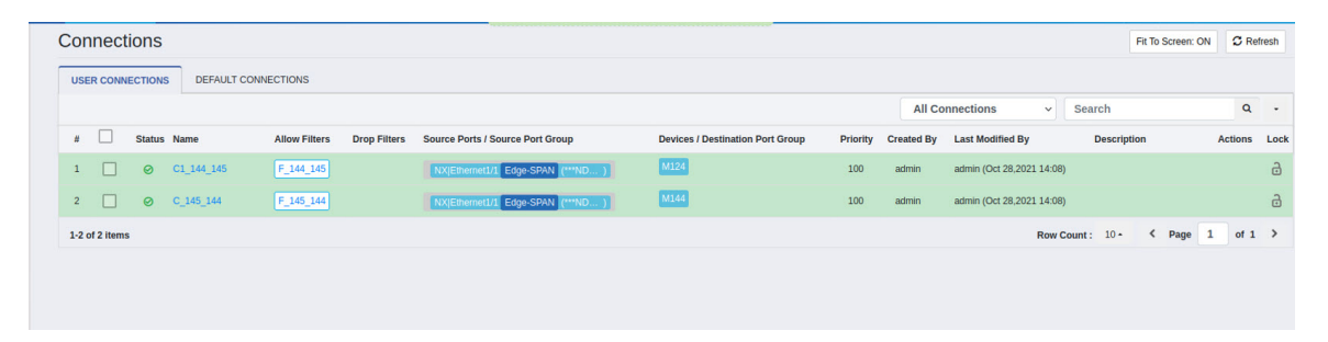
Figure 3: GUI enhancement - Connections (with configuration buttons)