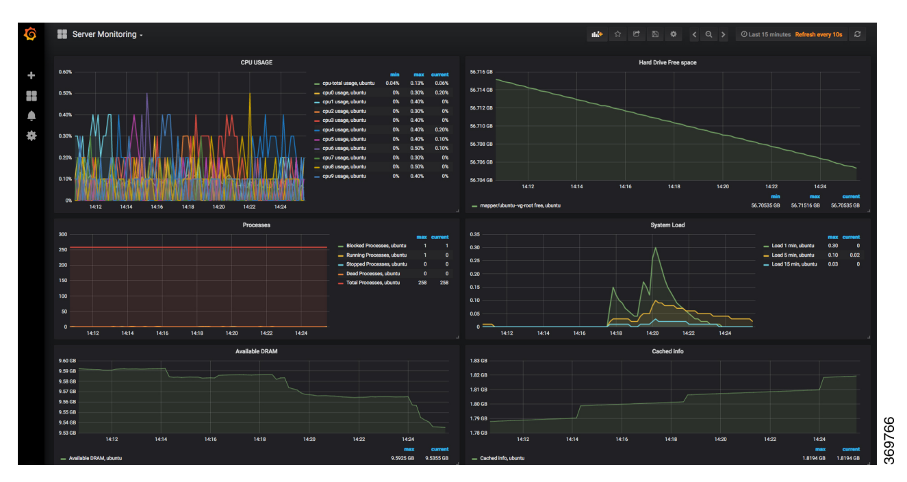
Figure 3: Visual Analysis of System Monitoring using Telemetry Data

In conclusion, telemetry data shows that various parameters of the network can be monitored simulatanously. This data is streamed in near real-time without affecting the performance of the network. With this data, you gain better visibility into your network.