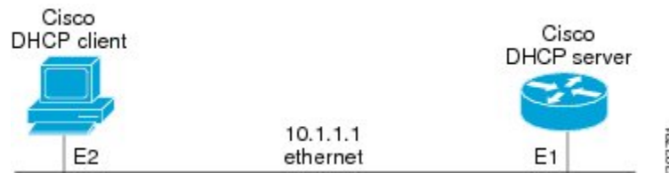
Figure 2: Topology Showing a DHCP Client with a Gigabit Ethernet Interface

On the DHCP server, the configuration is as follows: