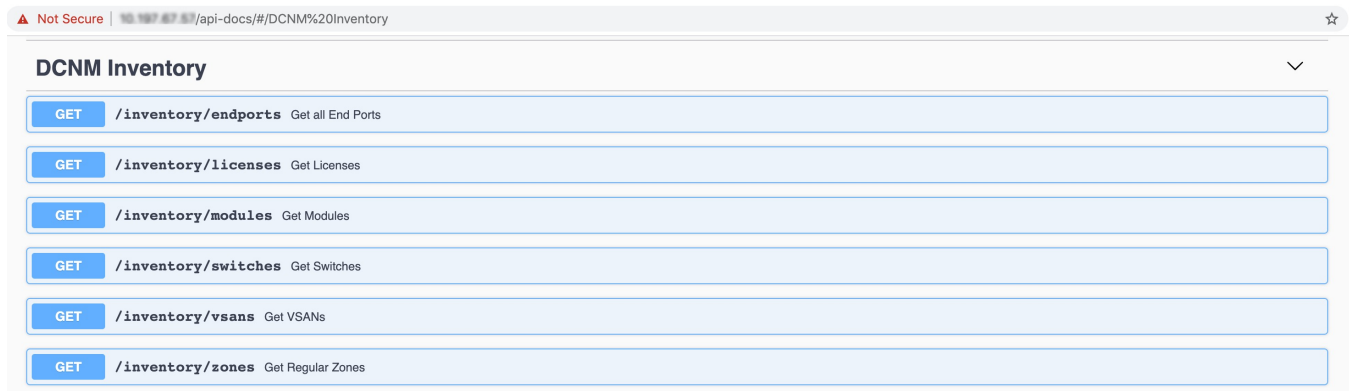
Figure 2: APIs in the DCNM Inventory Category