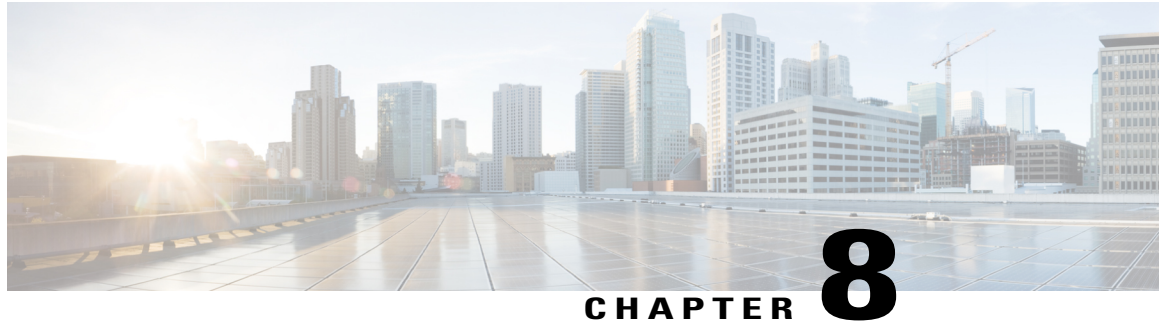
Table Based Configuration

The table-based video is a local session management that provisions using CLI. The statically allocated local video sessions can be either unicast or multicast video stream.