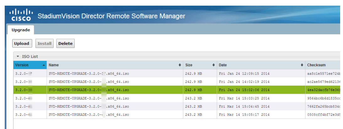
Figure 3 ISO File Selection and Upload