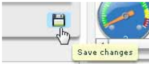
Figure 2 Save Changes Icon