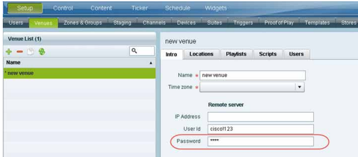
Figure 4 Remote Server Password Configuration

Note: Although you can always configure this option, it is only used when the “Use JMX Global credentials property?” is set to No in the Management Dashboard.