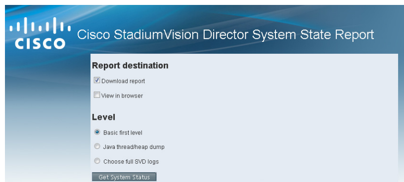
Figure 1 System State Report Screen

Table 1 describes the options provided on the System State Report screen.