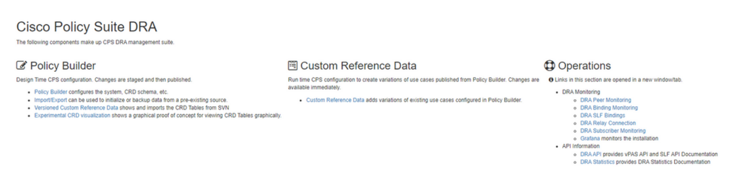
Step 2. Select Import/Export under Policy Builder.

Step 1. Log in to CPS Central with <master-ip>/central/dra/ as shown in the image.