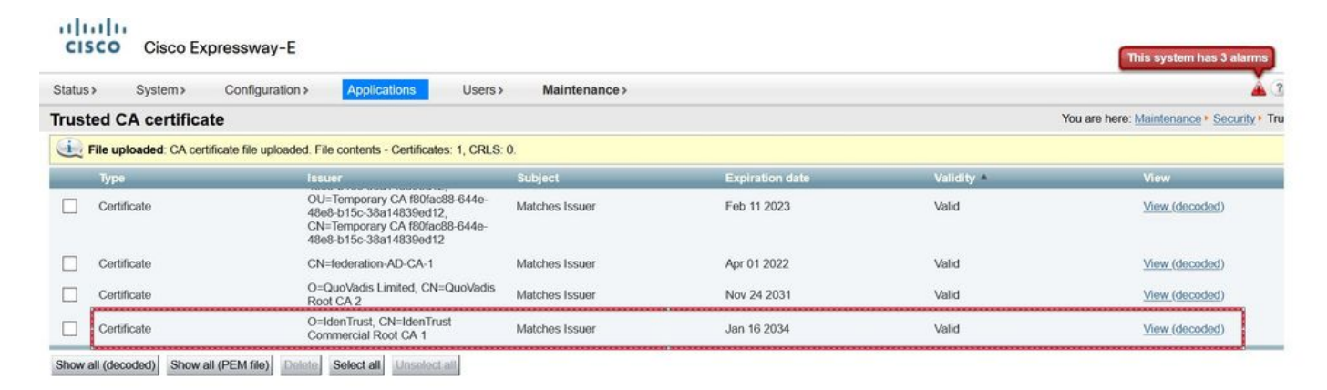
Step 3 : Verify the certificate successfully uploaded and is present in the VCS / Expressway Trust Store

No reboot or restart is required after this operation for the changes to take effect.