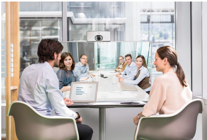
Figure 3. Cisco TelePresence® SX10 Quick Set Registered to Cisco Spark

Cisco Spark supports a range of video devices for use within a Cisco Spark meeting.