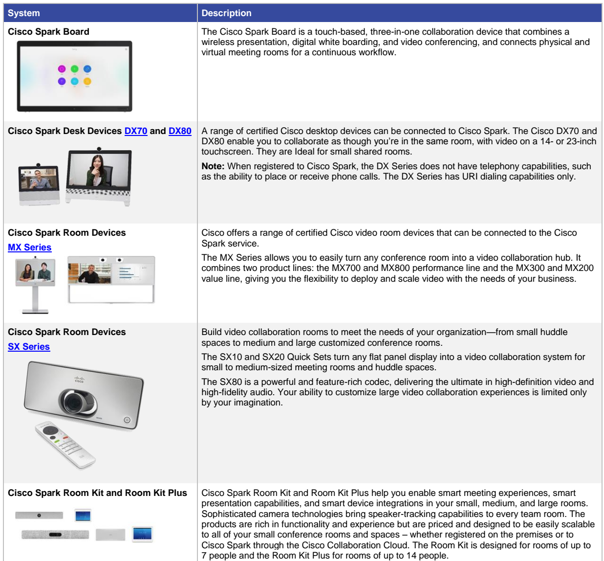
Table 1. Cisco Spark Room Devices Supported by Cisco Spark

A Cisco Spark room device requires the purchase of a subscription for one-to-one SIP-based calling. For meeting capabilities, you will need a meeting service. Cisco Spark room devices are supported with Cisco Spark basic and advanced meetings capabilities or with Cisco WebEx. All calls on the Cisco Spark room device and the Cisco Spark app are fully encrypted from end to end. The Cisco Spark room device also encrypts device registration and activation. Even the management is secure because all administrative and end-user interfaces are encrypted. Table 1 describes the features of the Cisco Spark room devices.