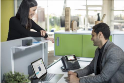
Figure 5. Cisco Spark Calling