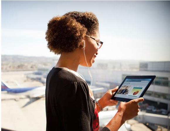
Figure 2. Cisco Spark Meetings

Cisco Spark has two meeting offers to suit different work styles.