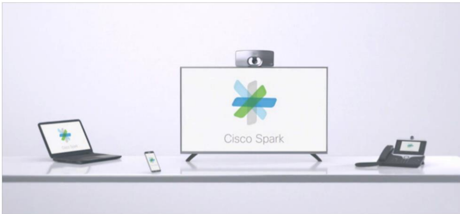
Figure 1. Cisco Spark

Digitization is transforming the tools we use (the workplace) and the way we work together (workstreams) with organizational processes and with business process applications and tools.