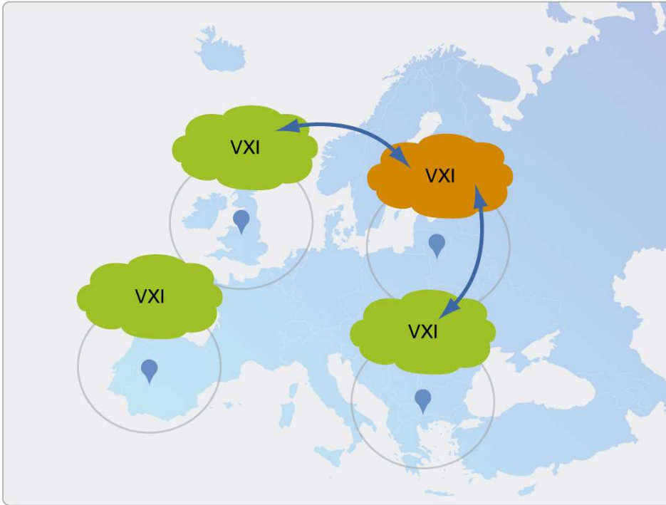
Figure 2. Virtual Desktops with Cloud Intelligent Network

A prime example of real-world use of Cloud Intelligent Networking is Cisco's Virtualization Experience Infrastructure (VXI), an end-to-end systems approach that delivers the next-generation virtual workspace by unifying virtual desktops, voice, and video. When a demand surge in one location exceeds capacity thresholds, demand can be moved to other data centers, offloading to those with available capacity, to optimize and extend provisioning across all available data centers.