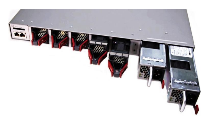
Figure 6. Redundant Fan and Power Supply

Cisco Catalyst 4500-X switch provides redundant hot swappable fans and power supplies (Figure 7) for highest resiliency with no single point of failure.