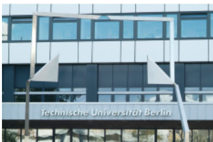
A future-orientated IT infrastructure for a modern university, Berlin's TU is using the Cisco Unified Computing System