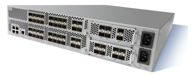
Figure 1. The Cisco Nexus 5000 Series includes the Cisco Nexus 5020 that supports 10 Gigabit Ethernet, Cisco Data Center Ethernet, and FCoE

Today's data centers are increasingly filled with dense, rack-mount and blade servers that host powerful multicore processors. The rapid increase of in-rack computing density, along with the increasing use of virtualization software, combine to push the demand for 10 Gigabit Ethernet and consolidated I/O: applications for which the Cisco Nexus 5000 Series is the perfect match. With low latency, front-to-back cooling, and rear-facing ports, the Cisco Nexus 5000 Series is designed for data centers transitioning to 10 Gigabit Ethernet as well as for those ready to deploy a unified fabric that can handle their LAN, SAN and server cluster, networking all over a single link (or dual links for redundancy).