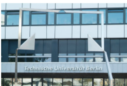
A future-orientated IT infrastructure for a modern university, Berlin's TU is using the Cisco Unified Computing System