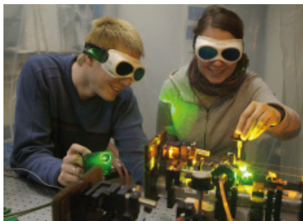
Inquiring minds: students using a dye laser for nanophotonic measurements