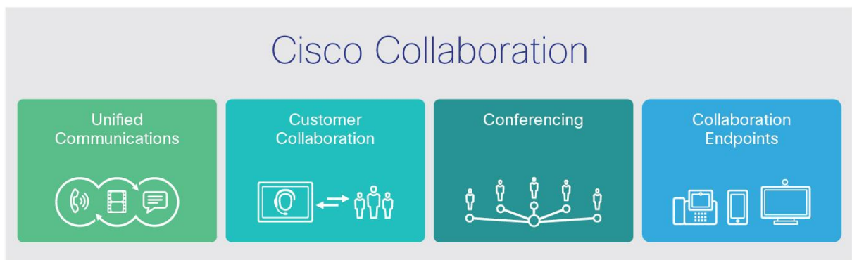
Figure 2. Cisco Collaboration Portfolio

The Cisco Collaboration portfolio comprises four product categories that together deliver best-in-class collaboration experiences (Figure 2).