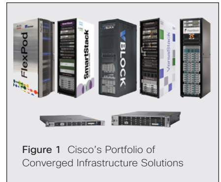
Figure 1 Cisco's Portfolio of Converged Infrastructure Solutions

Your business needs are constantly changing, and your IT infrastructure should adapt to support these demands and your workloads with ease. Cisco converged infrastructure solutions let you scale and repurpose systems without having to adjust your software or your networking capabilities or interrupt operations. You can purchase the systems you need today and scale up your integrated infrastructure for greater performance and capacity (adding or upgrading computing, network, or storage resources), or scale out if you need multiple consistent deployments (adding