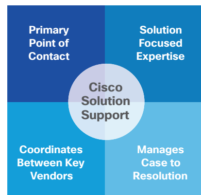
Figure 1. Cisco Solution Support Features