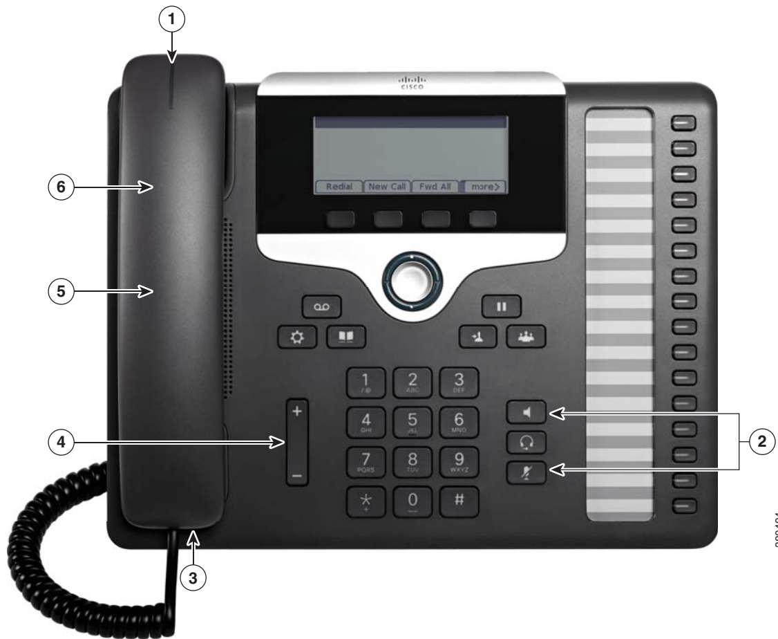
Figure 1 Hearing-Impaired Features—Cisco IP Phone 7861 Shown