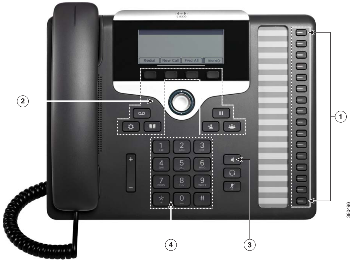
Figure 3 Mobility-Impaired Features—Cisco IP Phone 7861 Shown