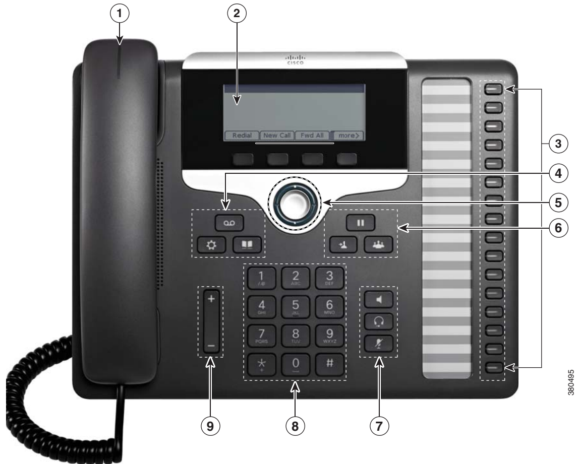
Figure 2 Vision-Impaired and Blind Accessibility Features—Cisco IP Phone 7861 Shown