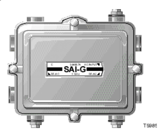
High Current Power Inserter