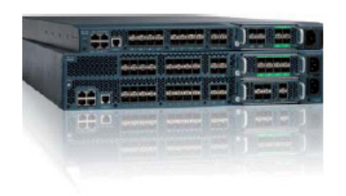
The UCS Fabric Interconnect links up not only the individual UCS system components, but also the UCS with the network and storage core systems in the data center