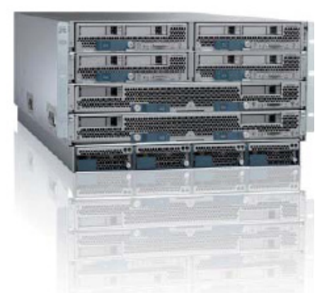
The UCS chassis: small, compact, space-saving