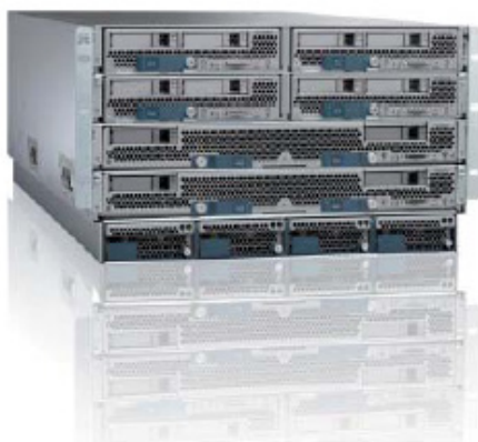
The UCS chassis: small, compact, space-saving