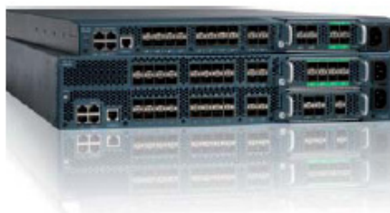
The UCS Fabric Interconnect links up not only the individual UCS system components, but also the UCS with the network and storage core systems in the data center

The Cisco Nexus 5000 Series Switch was the first Ethernet switch on the market to be able to handle FCoE. In the near future, this capability will also apply to the Cisco Nexus 7000 Series Switch core models, via a straightforward firmware upgrade. But what does this all mean in practical terms for the inner workings of a data center? “Firstly, Unified Fabric nearly always means a radical input/output consolidation on the server rack,” says Dousse. “Where we previously needed 80 cables, we now only need eight: a reduction by the factor of ten. This not only cuts down the investment required, it also simplifies scalability. Installation and maintenance work are also substantially reduced.”