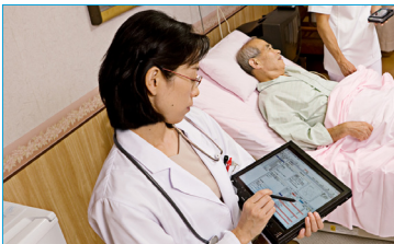
Telemedicine brings urgent specialty care to rural locations