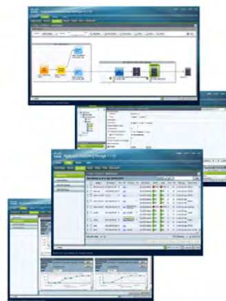
Above: Cisco Application Networking Manager (ANM) provides centralised management capabilities for Cisco ACE.