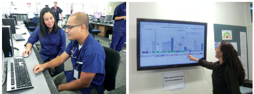
Above: Healthcare staff enjoying uninterrupted access to applications

Since the Cisco ACE modules were deployed, the organisation has dramatically increased the availability of key healthcare applications, particularly the ones that require 24/7 operation, such as Exchange, lab and PACS systems. “It’s been a revolutionary change for us. Before Cisco ACE, we had to have planned outages practically every three months. Since the implementation, some of our applications have been up and running without interruption for years,” said Grant. “Now, whenever we have to deliver a service without interruption, the first I do is put it on Cisco ACE,” he added.